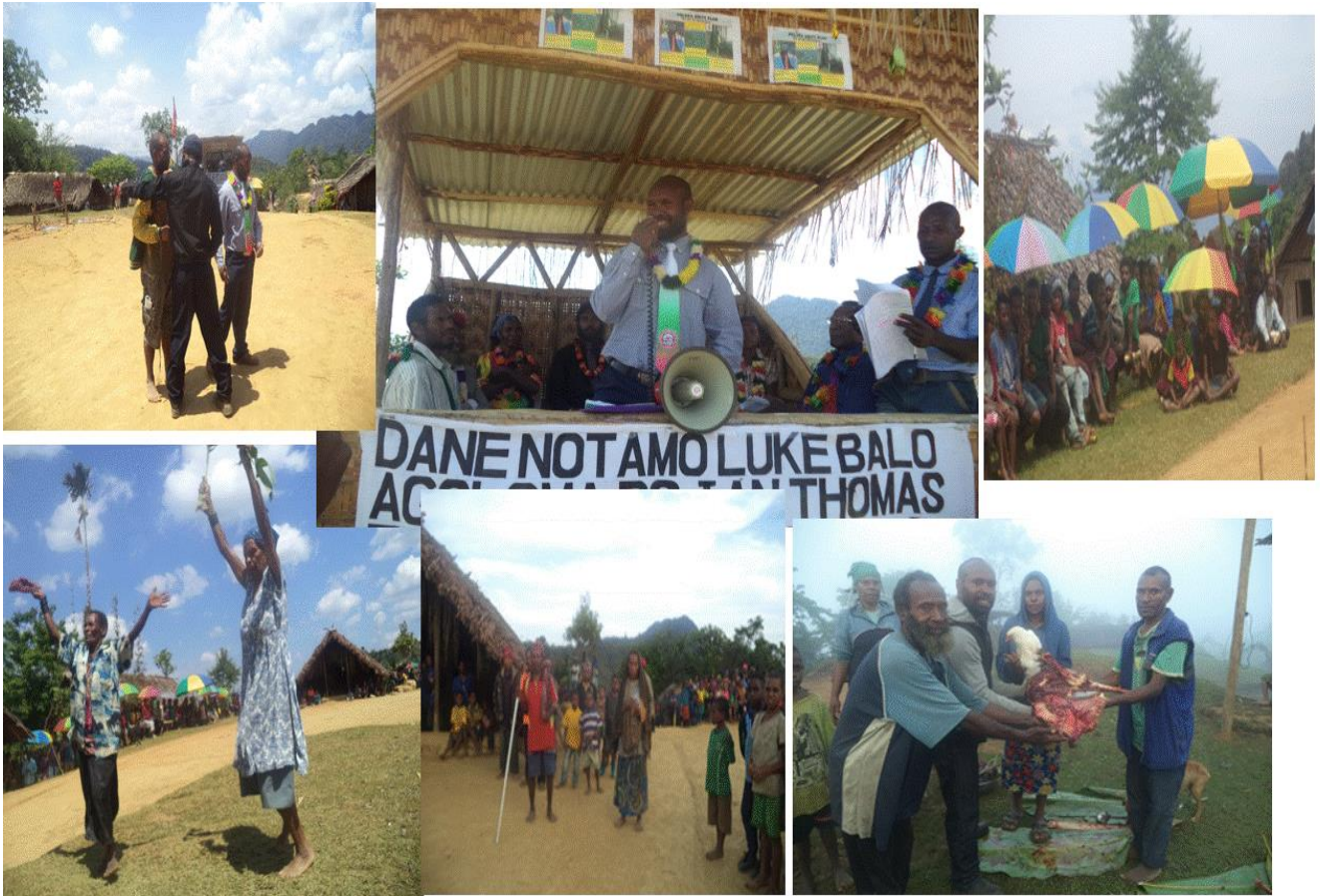
*Events & Dates*