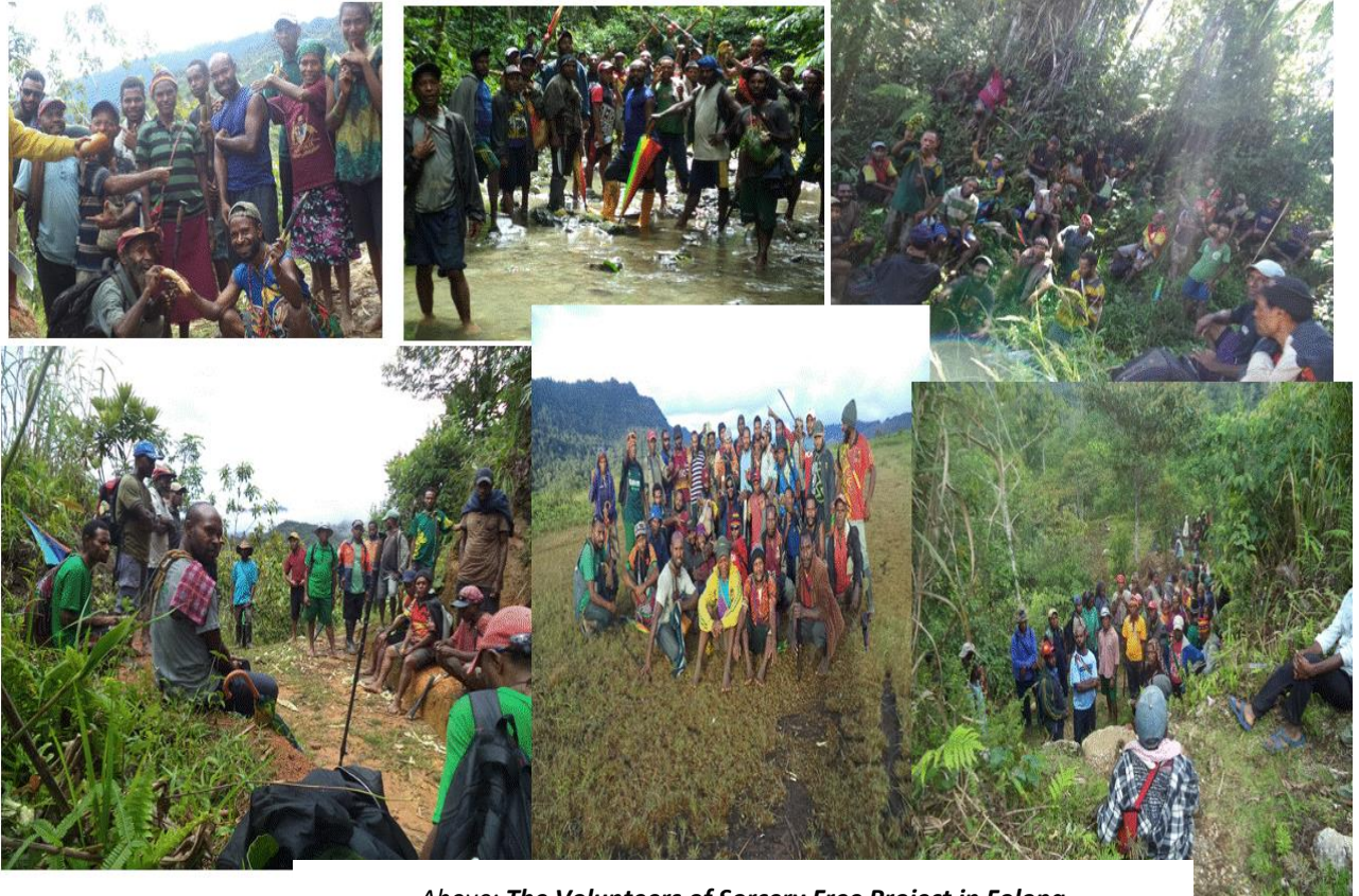
Above: The Volunteers of Sorcery Free Project in Folopa

PSSPNG-CA Inc. primary target was to involve youth, women and church groups to take the lead for the sorcery free project in Folopa. The execution of the project was done purely by volunteers. There were a total of 173 FVYG and five churches that participated in the Project.