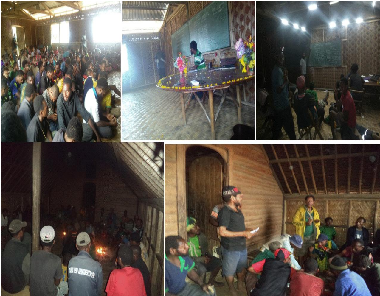
Above: Induction and Inception worship of FVYG for the Stop Sorcery Project.

The former Prime Minister (Peter O'Neil) dedicated the tasks of addressing sorcery related responsibility to PNG council of churches to address sorcery issue in rural communities. Therefore, we have actively involved the pastors of the different churches and the active youth to carry out the awareness on the Stop Sorcery Project in the Folopa area.